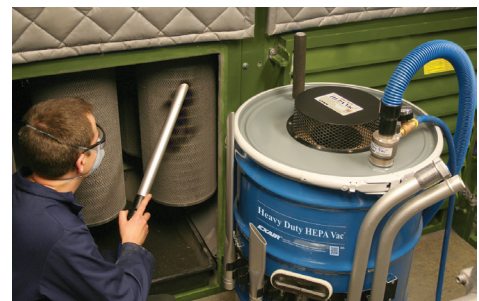
A clogged filtering system for a buffing booth is quickly cleaned and put back into service using the Heavy Duty HEPA Vac.