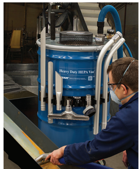
A technician uses a Heavy Duty HEPA Vac to perform scheduled maintenance on a pulverizer.