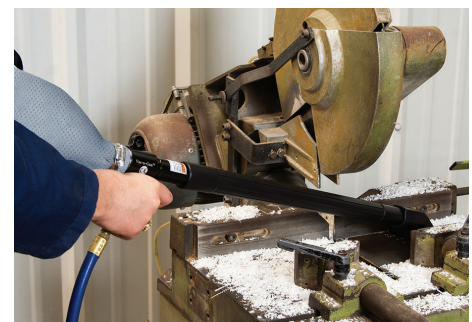
Model 6392 Vac-u-Gun All Purpose System removes plastic shavings from a saw.