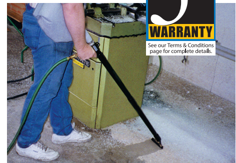
Model 6192 Vac-u-Gun Collection System vacuums absorbent and chips.

Built to Last 5yr. WARRANTY See our Terms & Conditions page for complete details.