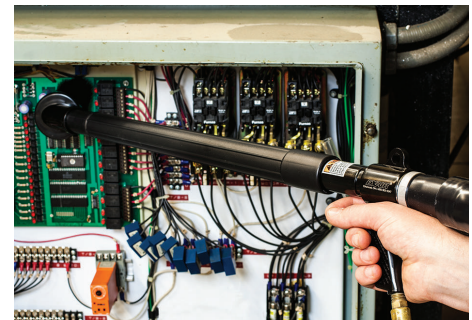
Model 6292 Vac-u-Gun Transfer System carries dust away from sensitive electronic controls.